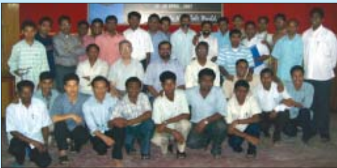
Participants of the 1st General Assembly

The General assembly and the erection of the North East Independent Delegation were held at St Claret Seminary, Umsning from 16 th to 20 th of April, 2007. The inaugural function was preceded by the General Assembly from 16 th to 19 th of April. The General Assembly officially commenced at 8.45 pm on 16 th , Monday, prior to which Fr. Superior General has given an animation talk at 4 .30 pm. On 17 th Assembly spent time on input sessions by various resource persons. Next two days, the Assembly has taken up reports of various communities for evaluations and deliberations. A working paper on the theme planted by the living waters - A VISION FOR 2020 - was presented and deliberated. After sufficient study and discussions, the assembly drafted a definite action plan for the Delegation for next three years. The Assembly was attended by 39 members.