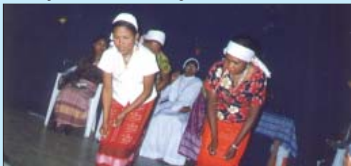
Garó women performing a cultural dance