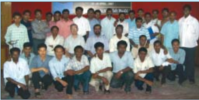
Participants of the 1st General Assembly

The General assembly and the erection of the North East Independent Delegation were held at St Claret Seminary, Umsning from 16 th to 20 th of April, 2007. The inaugural function was preceded by the General Assembly from 16 th to 19 th of April. The General Assembly officially commenced at 8.45 pm on 16 th , Monday, prior to which Fr. Superior General has given an animation talk at 4 .30 pm. On 17 th Assembly spent time on input sessions by various resource persons. Next two days, the Assembly has taken up reports of various communities for evaluations and deliberations. A working paper on the theme planted by the living waters - A VISION FOR 2020 - was presented and deliberated. After sufficient study and discussions, the assembly drafted a definite action plan for the Delegation for next three years. The Assembly was attended by 39 members.