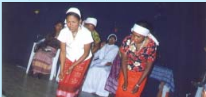
Garo women performing a cultural dance