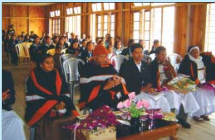
The Chief guest with other dignitaries of the day