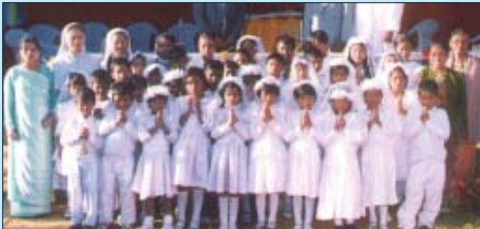
First Holy Communants with the Parish Priest