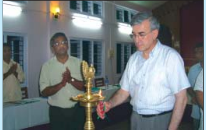
Rev. Fr. Superior General inaugurates the General Assembly