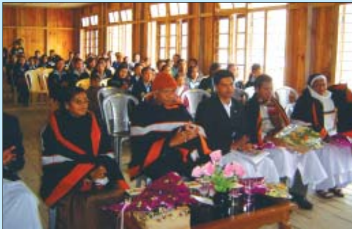
The Chief guest with other dignitaries of the day