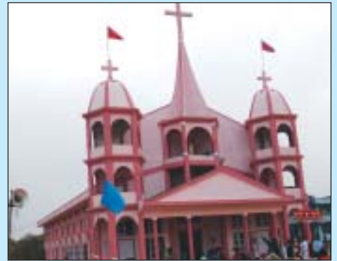
Newly built parish church at Nonghyllam