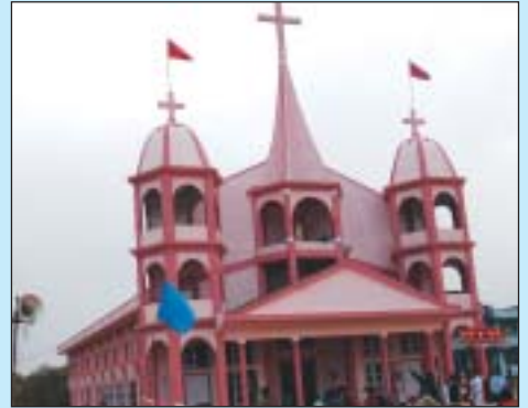
Newly built parish church at Nonghyllam